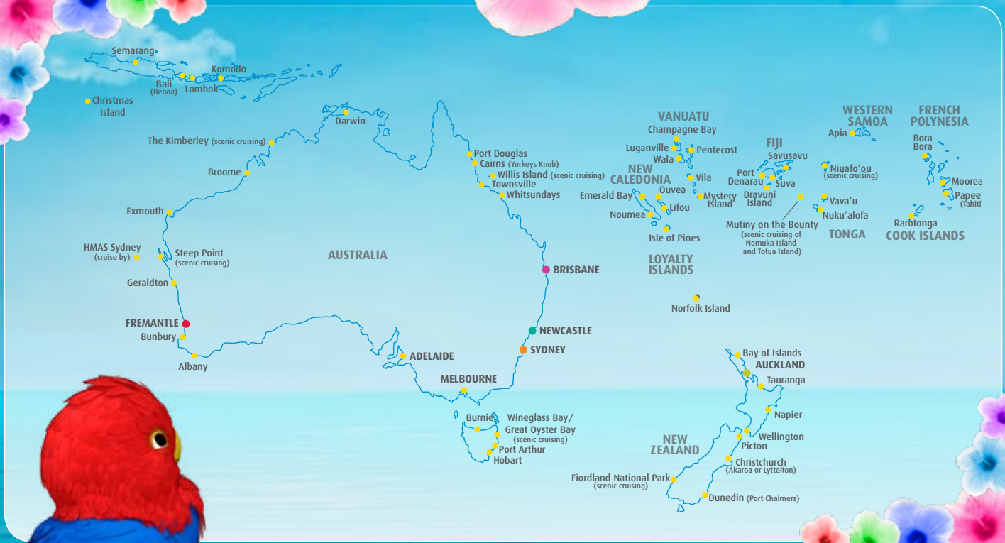
Map not to scale.